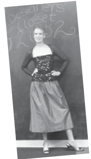
Some of the wonderful fashions you'll find at Designers' Closet!

the sale through October 9 th . Call us for more information at 923-5750.